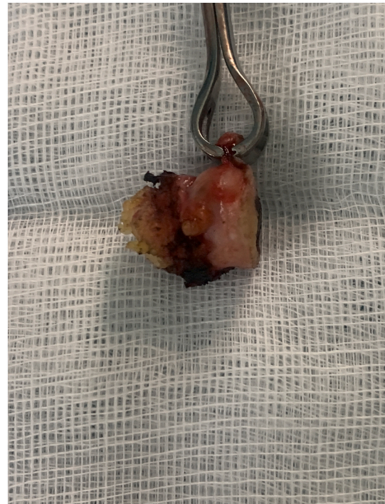
Fig. 4. Excised specimen.

The appearance of cutaneous endometriosis, both scar and primary umbilical on imaging depends on the number of stromal and glandular elements, the amount of bleeding, phase of the patient's menstrual cycle